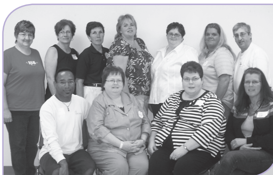
2009 council members representing direct care professionals across the state