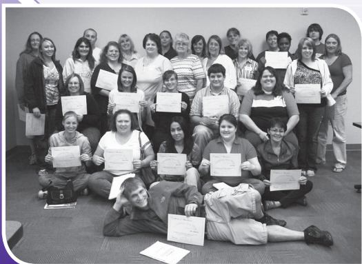
One of many Iowa CareGivers classes of Leadership graduates.

"I graduated from the Iowa CareGivers Leadership Program. It was awesome."