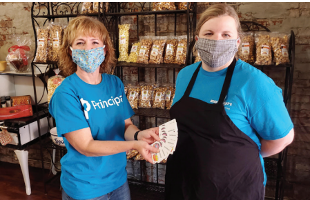
Principal volunteer with What's Poppin' merchant in Cedar Falls.

“Receiving the card and gift really lifted my spirits”