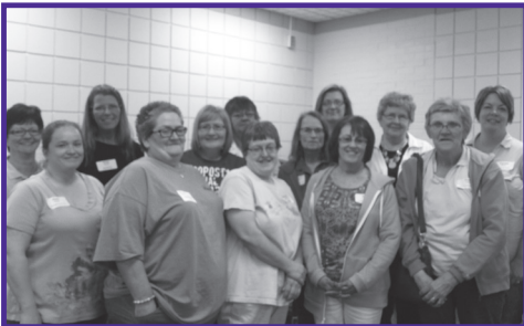
Carroll Regional Conference

Time spent in networking with other direct care professionals – communication with each other, sharing ideas, thoughts, and experiences. Variety of sessions, topics excellent! — Calmar Regional Conference Participant