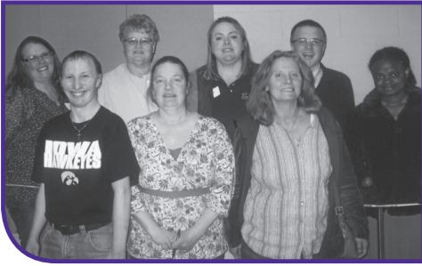
Muscatine Regional Conference

Personal Support, Professional Development, and Peer Networking