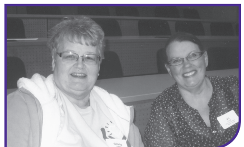
Muscatine Regional Conference