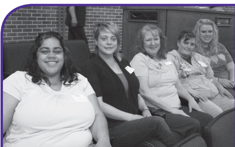
Creston Regional Conference

Thank you for all the excellent information! — Muscatine Regional Conference Participant