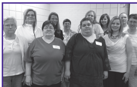
Carroll Regional Conference