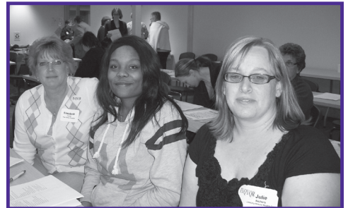
Calmar Regional Conference

I liked all the topics being discussed today. They are all useful to our daily work, to ourselves and the people we work with. — Creston Regional Conference Participant