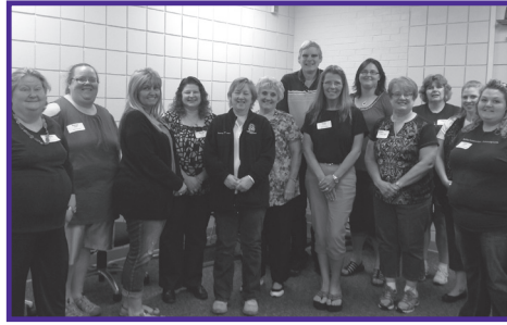
Carroll Regional Conference