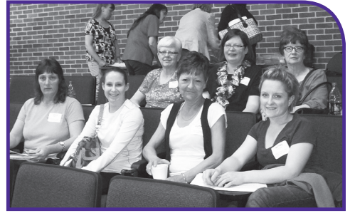
Creston Regional Conference

“I have been at this nursing home for 18 years and was getting burned out. This conference helped motivate me to want to go back to work and make it a better place for not only myself but the residents also.” — Carroll Regional Conference Participant