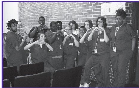
Job Corps Students at Creston Regional Conference