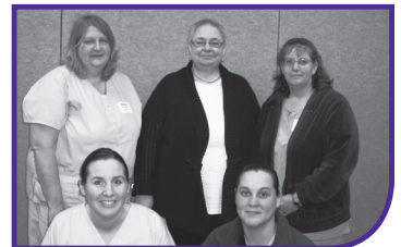
Sheldon Leadership Graduates