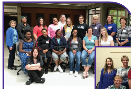
MCM Grads at Cedar Rapids, Dubuque, and Marshalltown

A series of Mouth Care Matters programs were offered this spring. Click here for more photos and highlights!