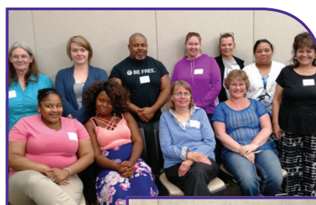
Graduates of the recent Core program hosted by DMACC Southridge

To learn more about Prepare to Care visit www.iowaparetocare.com .