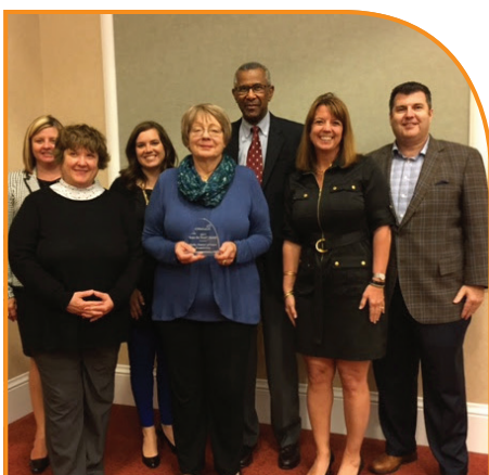
Delta Dental of Iowa Foundation & Lifelong Smiles Coalition Receive Iowa CareGivers 2017 From the Heart Recognition for Their Commitment to Improved Access to Good Oral Health Care For Older lowans Through Mouth Care Matters, Oral Health Training for Those in Direct Care!