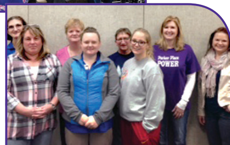
Graduates of Core Program hosted by Iowa Valley Continuing Education, Marshalltown