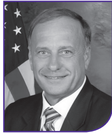
Congressman Steve King

Based on your knowledge of direct care workers and the services they provide, what issues do you believe Iowa's direct care workers face?