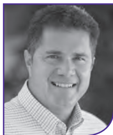
Congressman Bruce Braley

Having grown up in Brooklyn, IA, and worked my way through college and law school, I know how important it is to ensure that Iowans are able to put their skills to work in good-paying jobs. As a Member of Congress, I've worked in a bipartisan way to defend Medicare for Iowa seniors, increase Medicare reimbursements to Iowa providers, and increase wages for Iowa workers. I believe that we should promote policies that strengthen and expand the middle class, and help create the environment for job creation. Direct care workers are providing critical services to Iowans every single day, and are such important caregivers, and I'll fight to make sure that we're taking care of our caregivers.