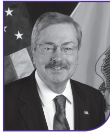
Governor Terry E. Branstad

Based on your knowledge of direct care workers and the services they provide, what issues do you believe Iowa's direct care workers face?