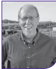
Congressman David Loeb sack

Further, as a member of the Rural Health Care Caucus, I will continue to work to ensure that all Iowans have access to high quality, affordable health care. This includes investments in improving care coordination and access to primary care, and a stronger emphasis on prevention and wellness. I will work to keep quality health care providers in Iowa as well as bring in new caregivers to Iowa.