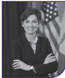
Lt. Governor Kim Reynolds

I would be honored and humbled to have your vote in November. Lt. Governor Kim Reynolds, recipient of the Iowa CareGivers Association "From the Heart" award, has walked in the shoes of a caregiver. Together, we see Iowa ready to grow, prosper and build upon what is great about our state and our people. We will continue working to make a difference in the lives of everyday families as they pursue their dreams by working to make education more affordable, jobs more plentiful and government responsive to the needs of all citizens.